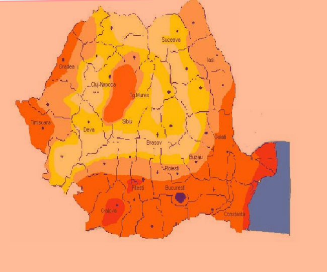
Fig.3 Distribution of solar radiation in Romania