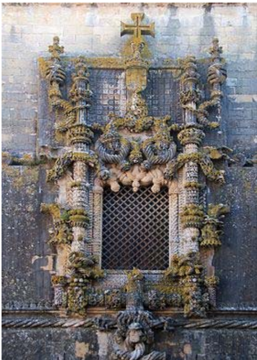
The famous chapterhouse window, made by Diogo de Arruda in 1510-1513.