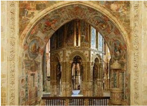
Detail of the round church, view from the nave