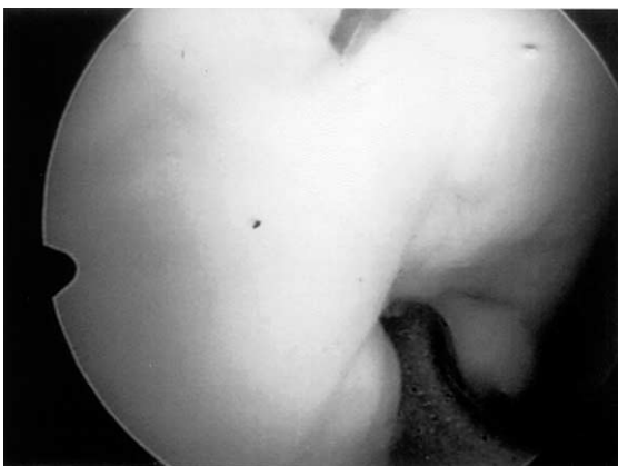
Fig. 1. Osteochondral lesion of the medial femoral condyle in a 35-year-old patient.

Osteochondral transplantation was combined with ACL reconstruction in 4 cases, lateral meniscal repair in 1 and a